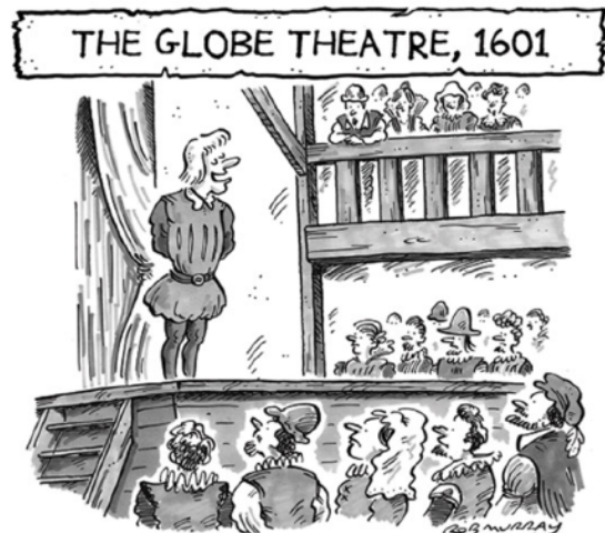
"The following play contains scenes of treachery, fratricide and indecision, which some viewers may find upsetting..."

The Whats On-Stage website is one of the best to keep you informed of theatre you can watch from home: www.whatsonstage.com/guide/free-online-streams-theatre-drama-musicals . "Theatres might currently be on shutdown with us all cooped up at home, but our guide will keep you up-to-date on accessing amazing theatre online (often for free) along with fun stagey features and interviews to keep you entertained – from the comfort of your own sofa! We'll make sure you don't miss a thing."