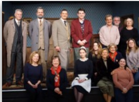
NODA crit - Bracken Moor