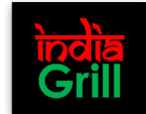
India Grill pre-theatre deal