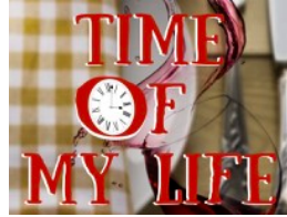
Our Next Production